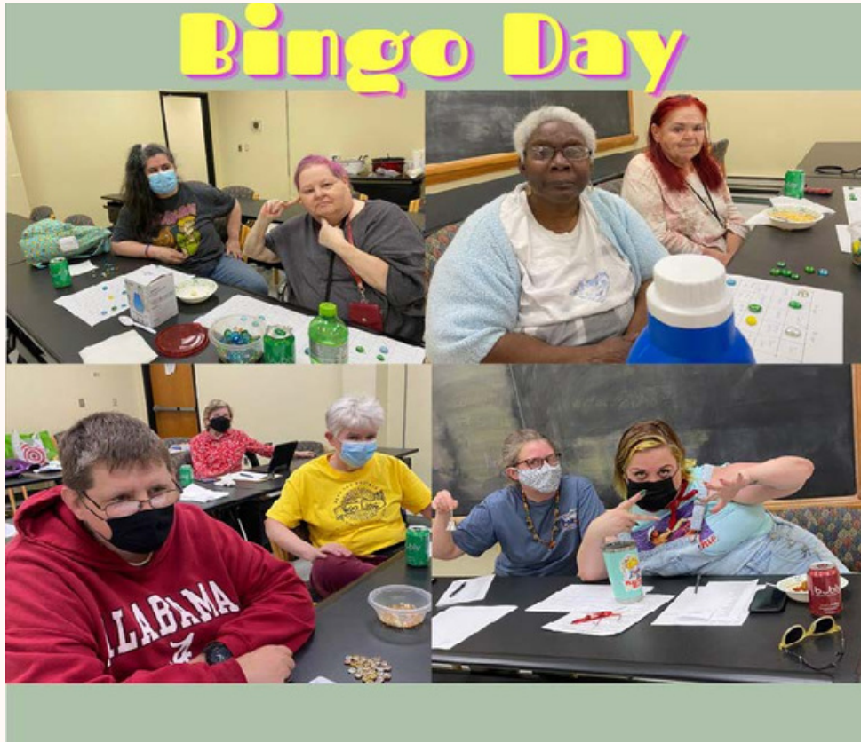
Upcoming BeechWood Events